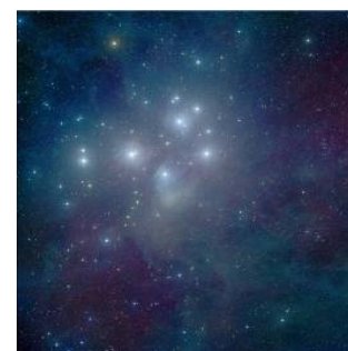
Figure 2: DSS pleiades mosaic generated by Montage

Montage/AstroPortal: The MONTAGE [9, Error! Reference source not found.] (see Figure 4) application is a national virtual observatory project [10] that stitches tiles of images of the sky from various sky surveys (e.g. SDSS [8]) into a photorealistic single image; it is well-studied for MTC [22]. The “ AstroPortal ” [7] offers a stacking service of astronomy images from the Sloan Digital Sky Survey (SDSS) dataset (currently at 10TB with over 300 million objects) [8] using grid resources. In the physics domain, the CMS detector being built to run at CERN’s Large Hadron Collider [11] is expected to generate over a petabyte of data per year. Supporting applications that can perform a wide range of analysis of the LHC data will require novel support for data intensive applications and many independent analysis tasks.